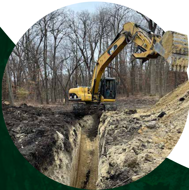
An excavator removes drain tile to restore a wetland basin in Otter Tail County.

Partnering with property owners and other conservation agencies to rehabilitate protected lands and waters.