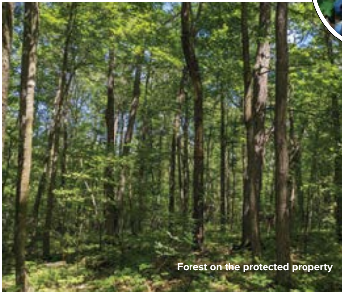
Forest on the protected property

Change is inevitable, even for a space that is protected forever. But gradual change is always easier to manage. By