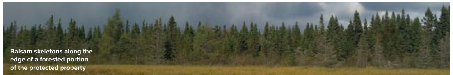
Balsam skeletons along the edge of a forested portion of the protected property