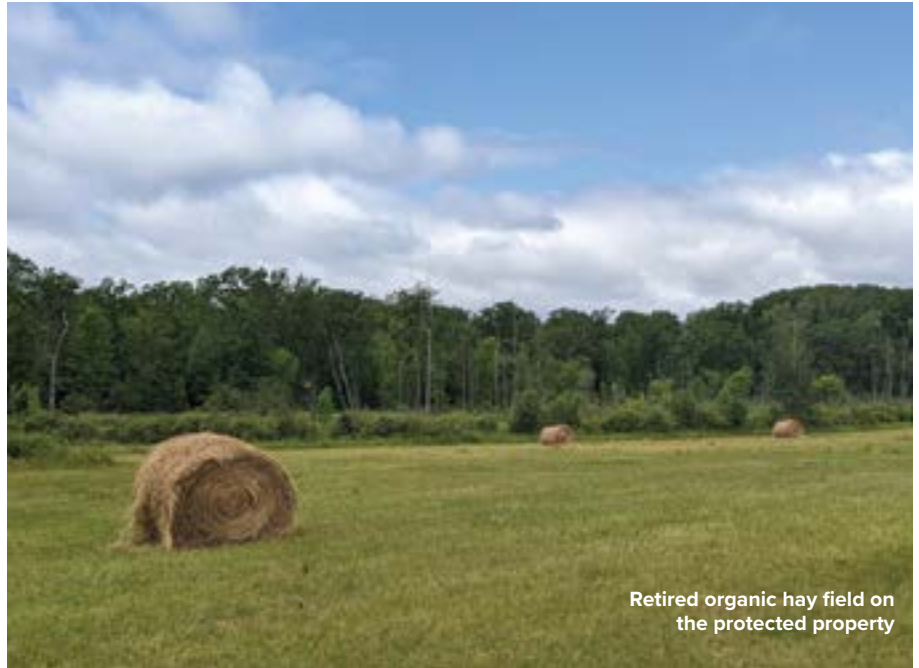
Retired organic hay field on the protected property