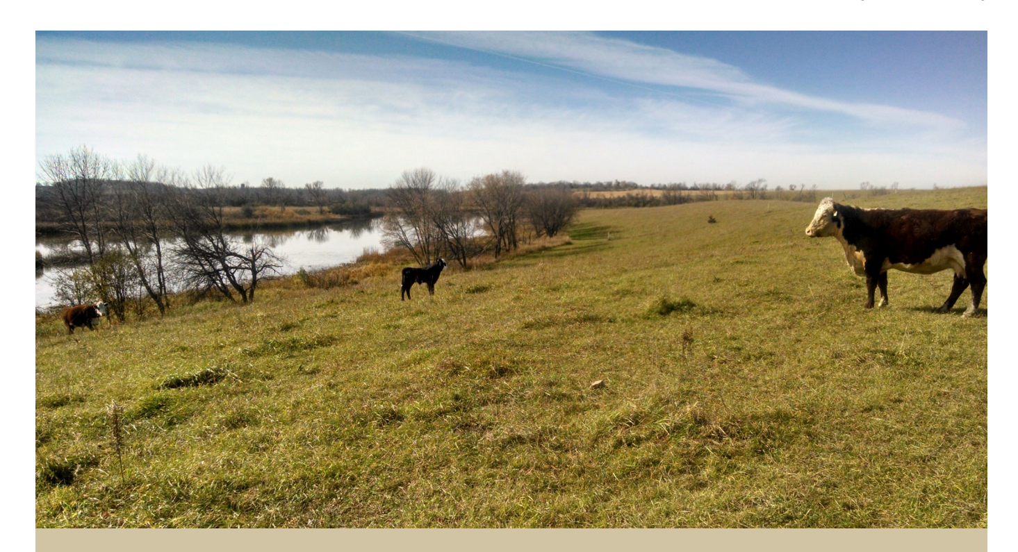
Conservation easements protect low-intensity grazing operations and western Minnesota grasslands.